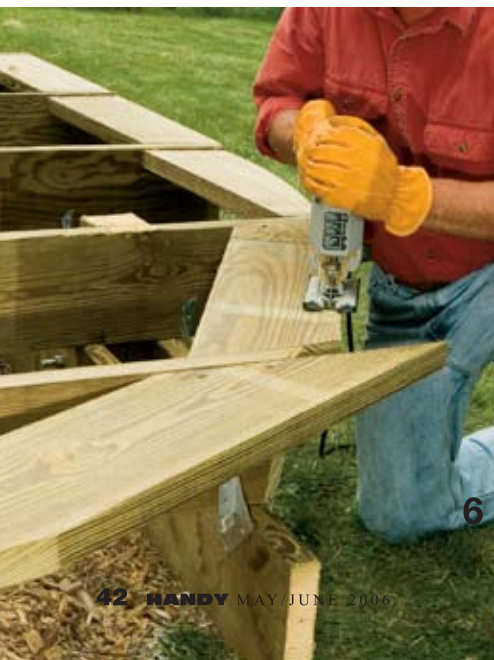
Reattach the trammel stick and use it as a guide to draw a curve onto the header sections.