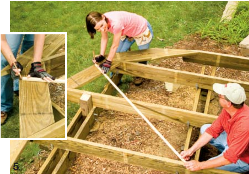
Fasten scrap lengths of 2x8 material between the joists to serve as headers.