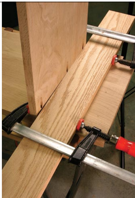
You can pull a cup out of a board by clamping the piece to a straightedge and pulling it tight with clamps before screwing it down.

Now use your jigsaw to cut as close to the lines as possible, and use a rasp and sandpaper to clean up the cuts. If you keep the pieces