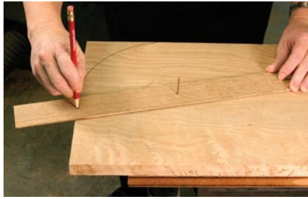
A thin piece of scrap, a nail and a drill are all it takes to make this simple compass jig.

from the nail, and stick a pencil point through it. Voilà – a compass jig.