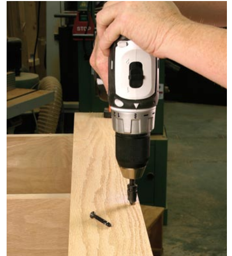
Make sure your drill is at a 90^\circ angle to the most narrow stock through which you're drilling – in this case, the \frac{3}{4} " edge of the side beneath the support.

clamped together during this process, you should end up with nearly identical arches. If you're not confident in your jigsaw skills, practice making curved cuts on some scrap pieces before moving on to the real thing.